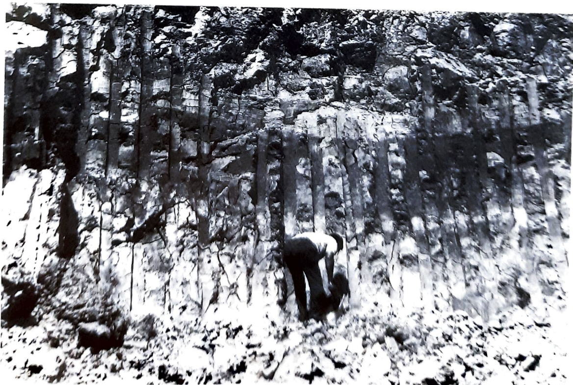
Figure 1. Mavli Mine Section at Redi showing Sindhudurg Formation