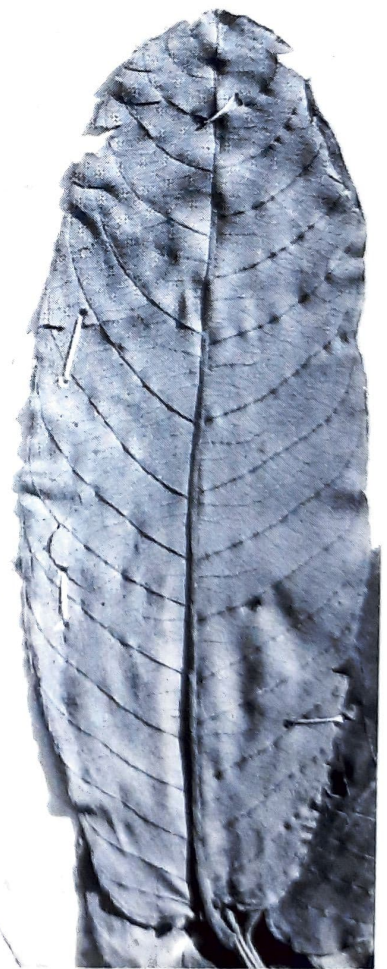
Figure 2. Extant leaf of Sophora benthamii Sterm. showing similarity with fossil leaf.