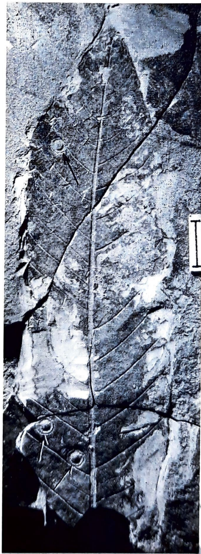
Figure 1. Fossil leaf of Sophora benthamii Sterm. Arrows indicate the position of insect gall, BSIP Museum no. 37554A, Natural size.

Leaf - Solitary specimen, showing more than 3/4 part of leaf impression. The preserved length of leaf is 10.5 cm and 3.0 cm wide at its widest part; narrow oblong in shape, apex acute, base not preserved, margin entire; texture chartaceous; venation pinnate, brochidodromous; primary vein stout, straight, secondary veins (2°) with acute angle of divergence, uniform, alternate, tertiary