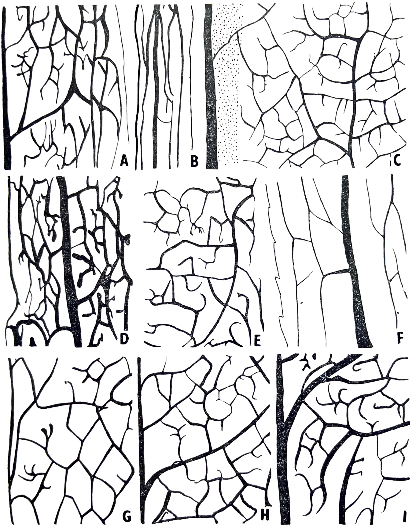
Fig. 4A-I. Venation pattern and the organization of arcoles in the series Rhinanthaeae (Contd.). A. Striga euphrasioides , \times 80 . B. Ramphicarpha longiflora , \times 80 . C. Centranthera hispida , \times 80 . D. Leptorhabdos benthaniana , \times 80 . E. L. parviflora , \times 80 . F. Sopubia delphinifolia ; \times 80 . G. Euphrasia officinalis ; \times 80 . H. Pedicularis carnosa , \times 80 . I. P. zeylanica , \times 100 .