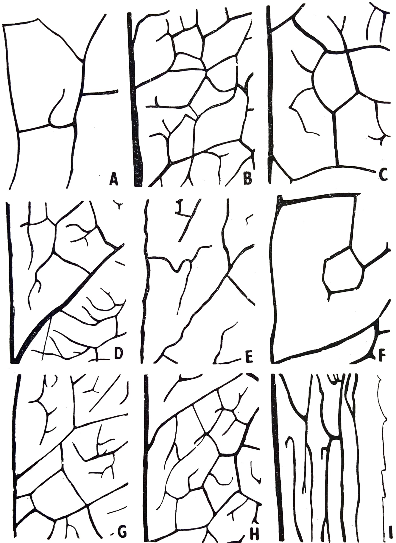
Fig. 3A-I. Venation patterns and types of areole organization in the series Rhinanthaeae. A. Hemiphragma heterophyllum , \times 80 . B. Scoparia dulcis , \times 80 . C. Picrorhiza kurrooa , \times 80 ; D. Wulfenia amherstiana , \times 80 . E. Veronica agrestis , \times 80 . F. V. serpyllifolia , \times 80 . G. V. anagallis , \times 80 . H. Buchnera hispida , \times 80 . I. Striga lutea , \times 80 .